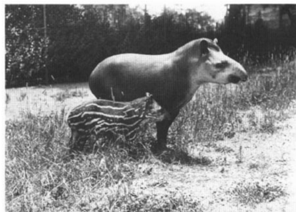
FIG. 1. Female Tapirus terrestris with juvenile.

DISTRIBUTION. The geographic range of T. terrestris (Fig. 3) includes areas from Rio Grande do Sul, Brazil, the Chaco of Argentina, Paraguay and Bolivia, northward through the Amazonian region of Brazil, Bolivia, Peru, Ecuador, Colombia, French Guiana, Surinam, and in Venezuela westward across the Sierra de Perira of